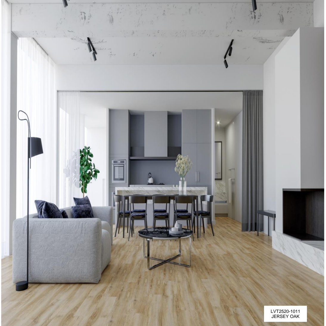
LVT2520-1011 JERSEY OAK