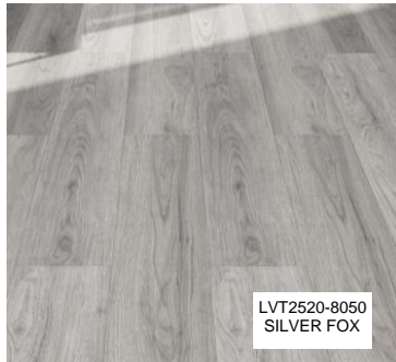
LVT2520-8050 SILVER FOX