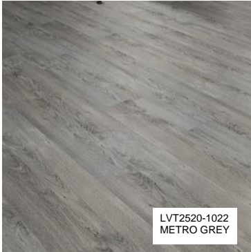
LVT2520-1022 METRO GREY