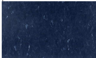
FLEXTILE VCT-149 OLD NAVY 412 CTNS/18,540 SQ FT