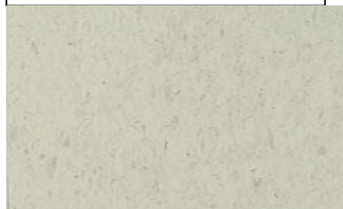
Congoleum - Alternatives AL116 Stark 21 ctns / 945 sq ft