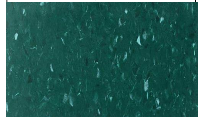
FLEXTILE VCT-119 GREEN BAYOU 107 CTNS/4815 SQ FT