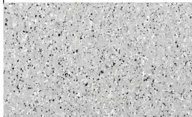
FLEXTILE VCT-404 SILVER QUILL 285 CTNS/12,825 SQ FT