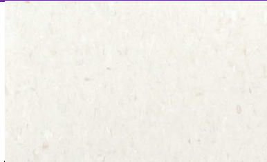
FLEXTILE CRYSTAL VCT-303 GRAY ICE 19 CTNS/855 SQ FT