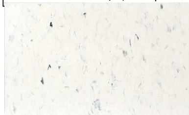
FLEXTILE VCT-173 WHITE CLOUD 107 CTNS/4815 SQ FT