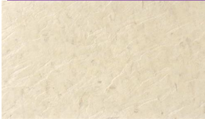
FLEXSLATE VCT- FS531 SAND POINT 180 CTNS/8100 SQ FT

CONTACT YOUR ACCOUNT MANAGER IMMEDIATELY TO PLACE YOUR ORDER BEFORE THESE SPECIALS