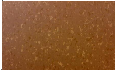
American Bilrite Vierra Tile 12 x 12 x 2mm 55 sq ft/ctn ALL650 - 72 ctns / 3,960 sq ft