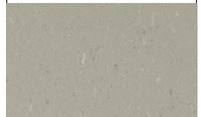
Congoleum - Alternatives AL206 Cirrus 20 ctns / 900 sq ft